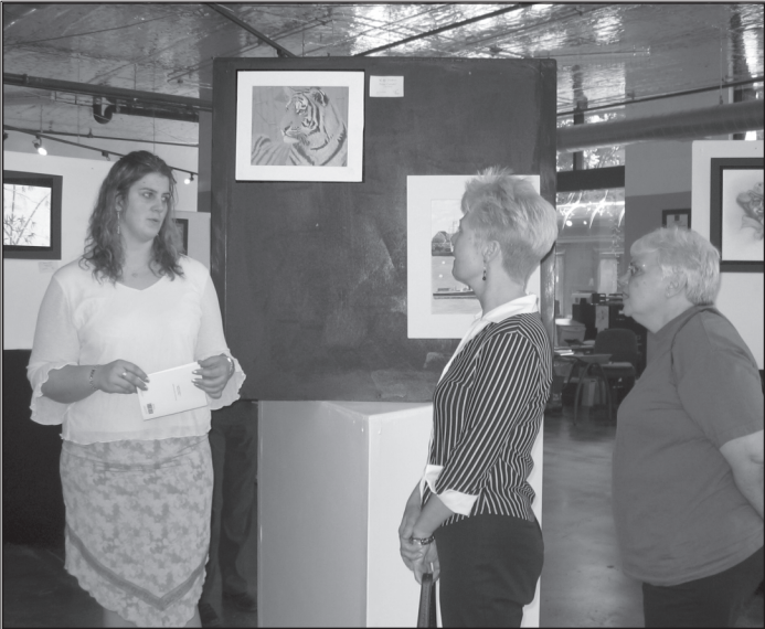
need caption for picture

CAPTIVE IMAGERY ART GALLERY 211 N.W. 5th Ave. Portland, OR 97209 (503) 222-5514