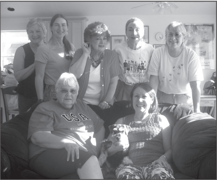
need names for caption