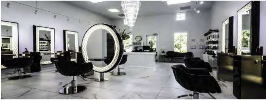
School of Cosmetology...