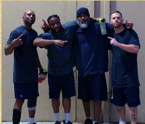
1st Place team: Pressure